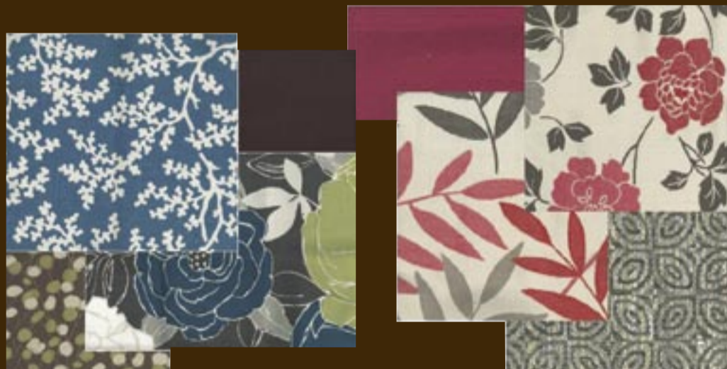
The new styling of The Devonshire Fell Bedrooms