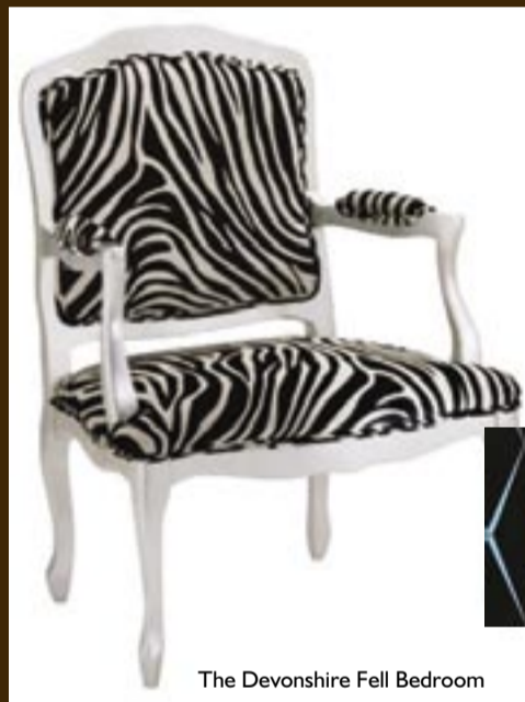
The Devonshire Fell Bedroom

For special offers in the new rooms in spring keep looking on www.thedevonshirefell.co.uk