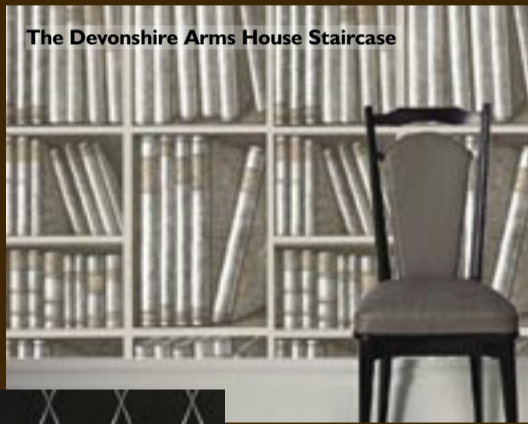
The Devonshire Arms House Staircase